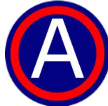
2 nd Infantry Division